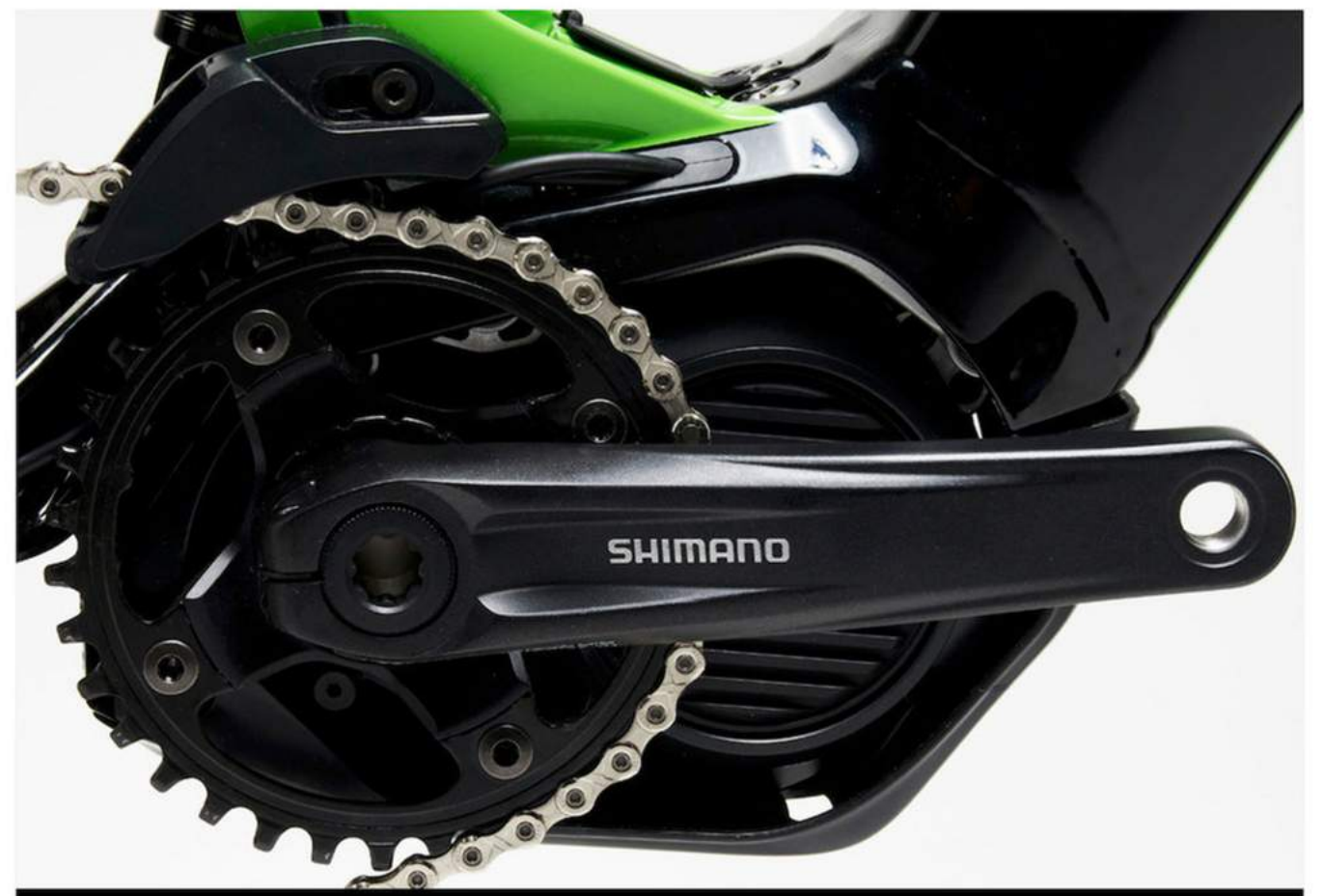
SHIMANO STEPS 8000